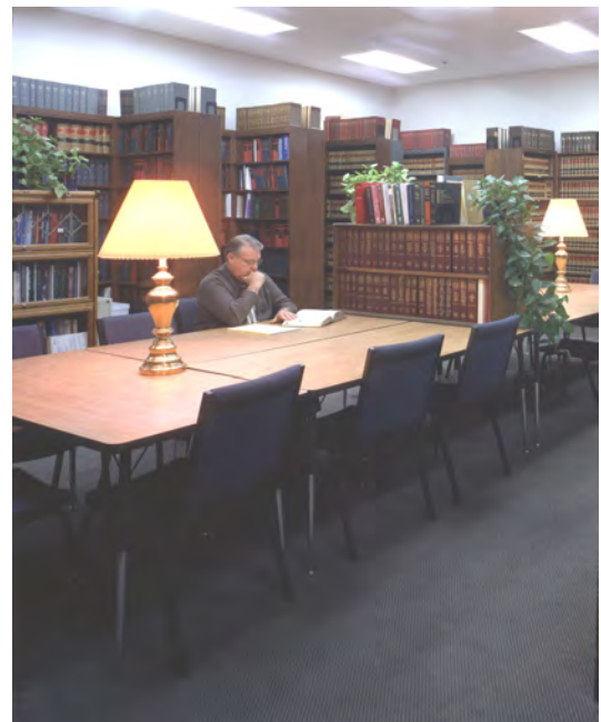
The Law Library houses over 10,000 volumes along with extensive computerized legal resources.

Computers are used as an integral part of the learning environment and are considered a part of the library facilities. High-speed and wireless Internet access is used as a library resource in several courses and classrooms. The College maintains a website at www.empcol.edu .