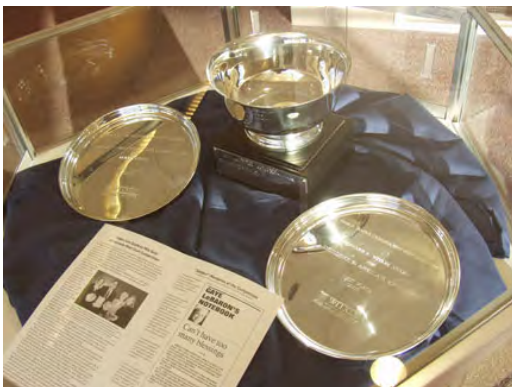
Empire College School of Law's Moot Court Teams have trophied numerous times at the Annual California Moot Court Competition.

All class sessions at Empire College School of Business are held at 3035 Cleveland Avenue, Santa Rosa, California. The campus is comprised of 44,000 square feet which includes 23 lecture and computer lab classrooms, as well as 2 medical wet labs. Empire College reviews equipment and software in scheduled curriculum reviews to ensure that they meet the training needs for gainful employment.