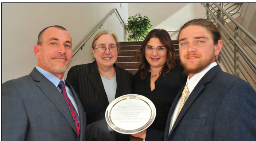
2019 2 nd Place for Oral Argument Best Appellant's Brief

In April 2000, Empire College School of Law's Moot Court Team captured first place at the 31 st Annual California Moot Court Competition. In 2001, Empire's team captured gold again at the State Bar's Environmental Negotiation Competition. Competing law schools included UCLA, Loyola, Pepperdine, Santa Clara, UC Davis, and UC Berkeley. Empire's teams also placed in the 2002, 2003, 2004, 2006, 2007, 2008, 2009, 2010, 2018, and 2019 California Moot Court Competitions.