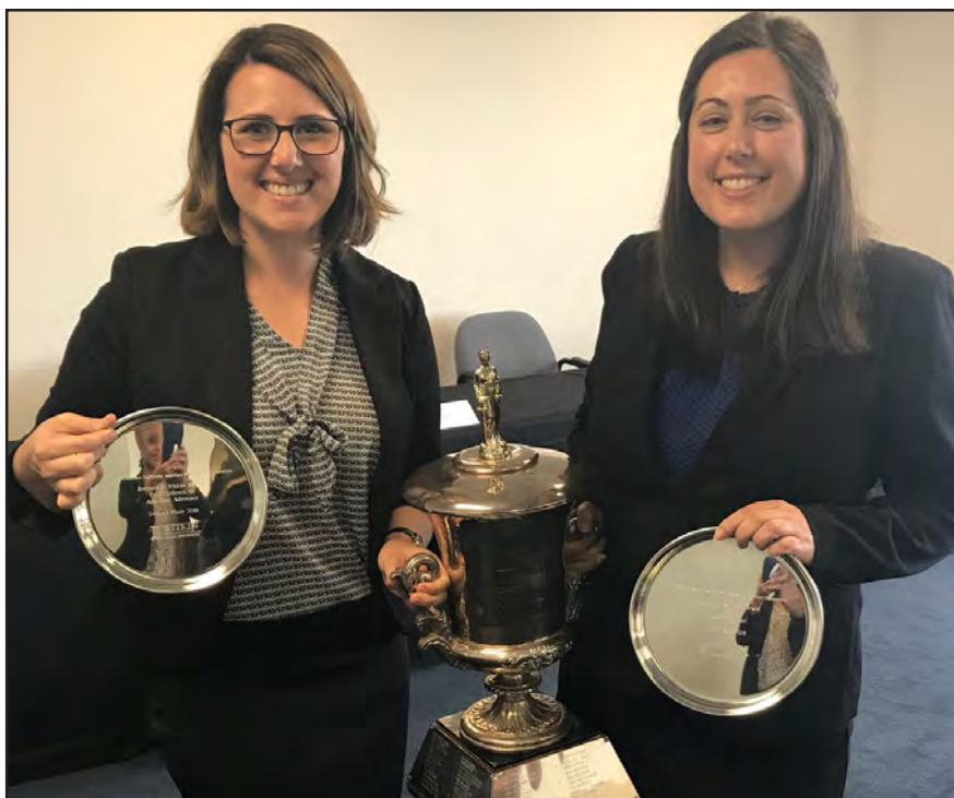
2018 Roger J. Traynor Award 1 st Place for Oral Argument

In April 2000, Empire College School of Law's Moot Court Team captured first place at the 31 st Annual California Moot Court Competition. In 2001, Empire's team captured gold again at the State Bar's Environmental Negotiation Competition. Competing law schools included UCLA, Loyola, Pepperdine, Santa Clara, UC Davis, and UC Berkeley. Empire's teams also placed in the 2002, 2003, 2004, 2006, 2007, 2008, 2009, 2010, 2018, and 2019 California Moot Court Competitions.