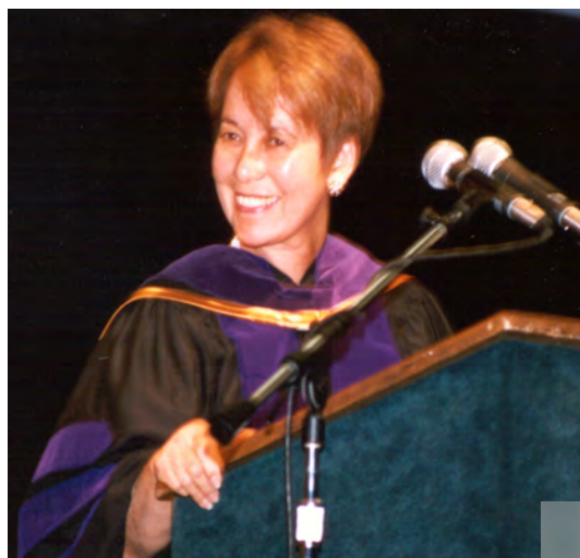
Notable commencement speakers have included (top to bottom): The Honorable Joyce Kennard, Associate Justice of the California Supreme Court; Willie Brown, Mayor of San Francisco; and Patricia Ireland, President of the National Organization for Women.