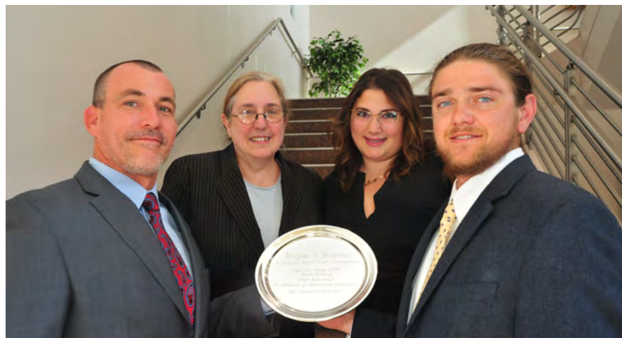
2019 2 nd Place for Oral Argument Best Appellant's Brief

In April 2000, Empire College School of Law's Moot Court Team captured first place at the 31 st Annual California Moot Court Competition. In 2001, Empire's team captured gold again at the State Bar's Environmental Negotiation Competition. Competing law schools included UCLA, Loyola, Pepperdine, Santa Clara, UC Davis, and UC Berkeley. Empire's teams also placed in the 2002, 2003, 2004, 2006, 2007, 2008, 2009, 2010, 2018, and 2019 California Moot Court Competitions.