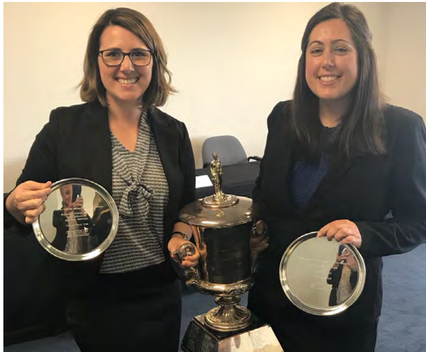
2018 Roger J. Traynor Award 1 st Place for Oral Argument

In April 2000, Empire College School of Law's Moot Court Team captured first place at the 31 st Annual California Moot Court Competition. In 2001, Empire's team captured gold again at the State Bar's Environmental Negotiation Competition. Competing law schools included UCLA, Loyola, Pepperdine, Santa Clara, UC Davis, and UC Berkeley. Empire's teams also placed in the 2002, 2003, 2004, 2006, 2007, 2008, 2009, 2010, 2018, and 2019 California Moot Court Competitions.