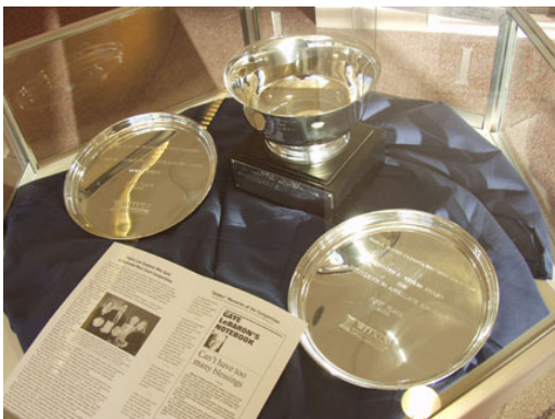
Empire College School of Law's Moot Court Teams have trophied numerous times at the Annual California Moot Court Competition.

All class sessions at Empire College School of Business are held at 3035 Cleveland Avenue, Santa Rosa, California. The campus is comprised of 44,000 square feet which includes 23 lecture and computer lab classrooms, as well as 2 medical wet labs. Empire College reviews equipment and software in scheduled curriculum reviews to ensure that they meet the training needs for gainful employment.