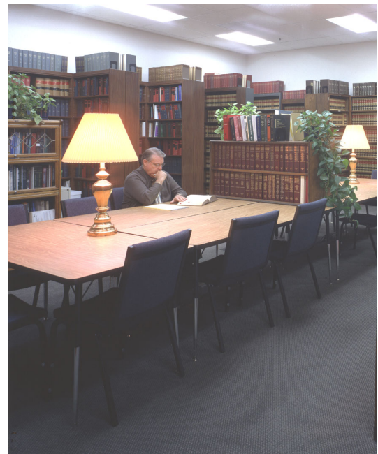
The Law Library houses over 10,000 volumes along with extensive computerized legal resources.

Computers are used as an integral part of the learning environment and are considered a part of the library facilities. High-speed and wireless Internet access is used as a library resource in several courses and classrooms. The College maintains a website at www.empcol.edu .