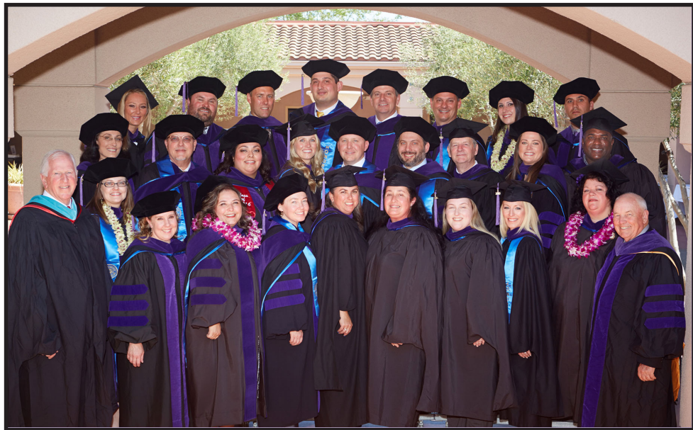
U.S. Congressman Mike Thompson delivered the commencement address to Empire College School of Law's Class of 2016.