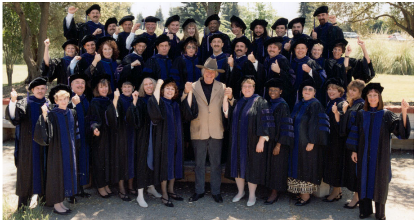
Renowned defense attorney Jerry Spence (front row, center) delivered the commencement address to the Class of 1994.

Note: The maximum non-refundable registration fee allowed by the VA is $10.00 for non-accredited schools.